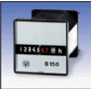
TWT-UV-HM Cumulative Hours in Operation Monitor ( Re-Settable )