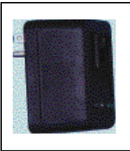
TWT-UV-AA This safety device sounds an alarm if the germicidal lamp becomes ineffective.