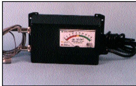
TWT-UV-MON This electronic safety device monitors lamp output and triggers the audible alarm when lamp output falls below recommended levels.