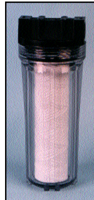
Unit comes with 2 20 Micron Filters (Filters not to scale)

Filter Media KDF 55 & GAC Amount 30 lbs.- 1 cu. ft. Flow Rate 3-8 GPM Height 63" X 12" Round Weight 100 lbs. Pressure 125 PSI Capacity More Than 2 Million Gal