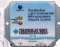
TWT-5C8-470 Residential / Light Commercial: For pipes up to 3/4"