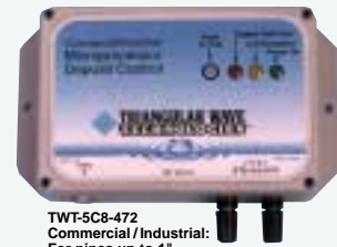
TWT-5C8-472 Commercial / Industrial: For pipes up to 1"