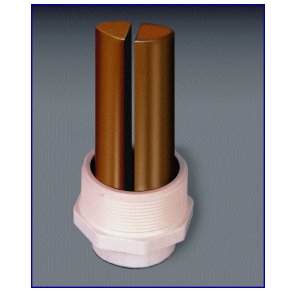
These units are all similar in appearance, but have different

Larger volume and pipe size application: Contact TWT, Inc. for recommendation