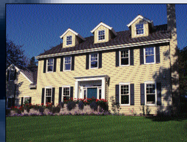
IN YOUR HOME