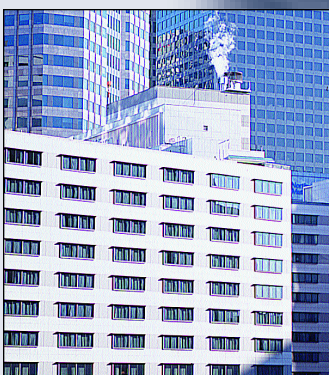
IN YOUR OFFICE