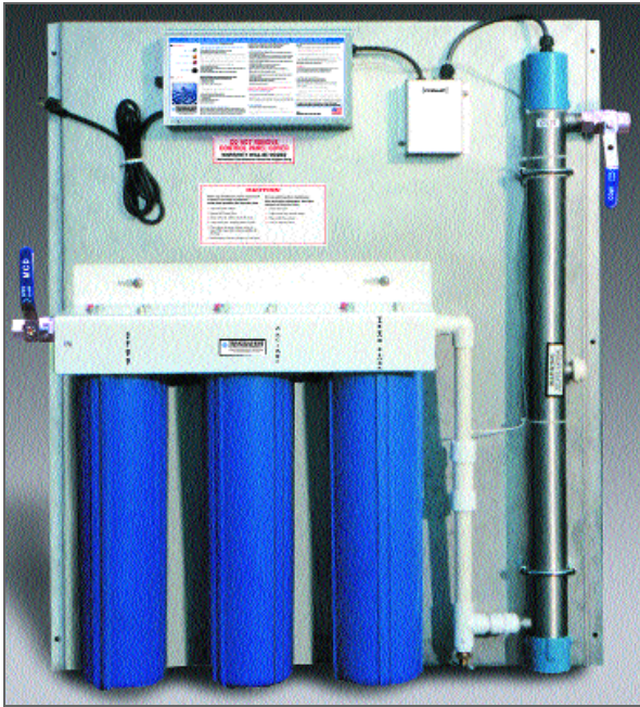
TWT-MD-1003 System consists of a Deposit Controller TWT-5C8-401 • TWT Reaction Chamber • UV-700 Disinfection System • TWT-MUC Filtration System Specifications: Factory assembled and mounted 42" H x 36" L x 8" D • Weight 40 lbs.