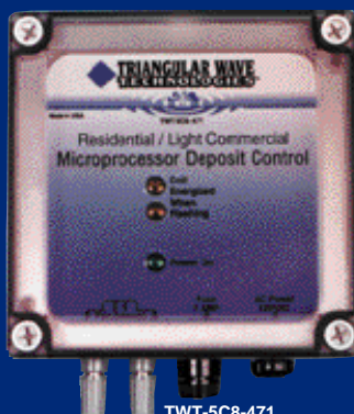
TWT-5C8-471 Residential / Light Commercial For pipes up to 1"