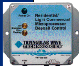
TWT-5C8-470 Residential/Light Commercial: For pipes up to 3/4"

TWT Microprocessor Deposit Control Systems represent a significant breakthrough in electromagnetic technology. This state-of-the-art electronic deposit controller provides continuous scale and bio-film control in fluid systems.