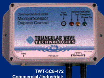
TWT-5C8-472 Commercial/Industrial: For pipes up to 1"